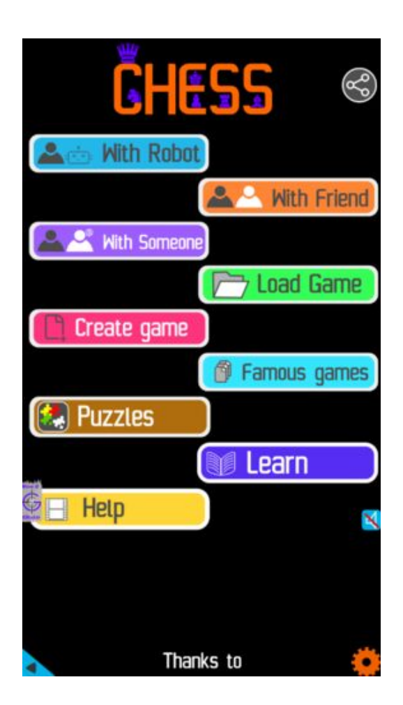
Figure 2: Play chess online for free. Solve puzzles and play with friends

Play chess for free at https://gbud.in/chs